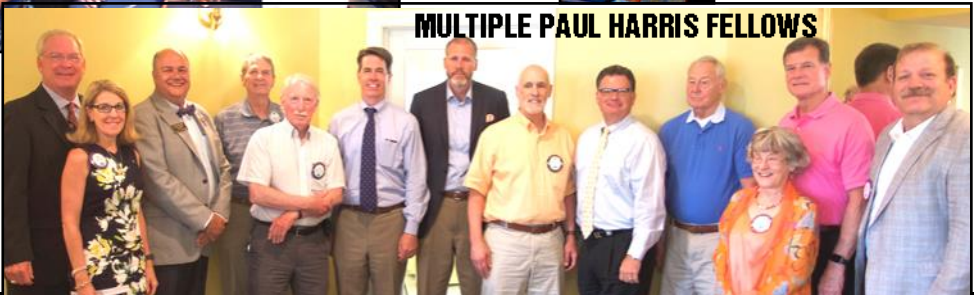
MULTIPLE PAUL HARRIS FELLOWS