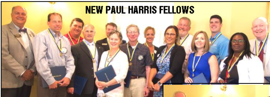
NEW PAUL HARRIS FELLOWS